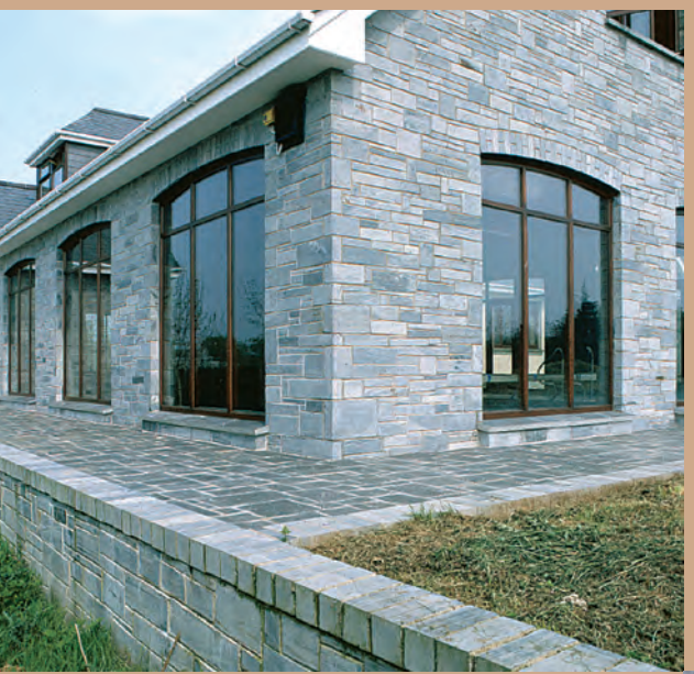
Natural Blue/Grey Quarry Faced and Rustic